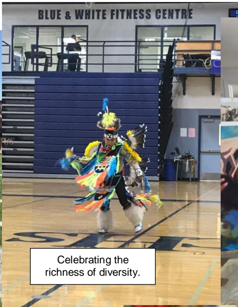
Celebrating the richness of diversity.