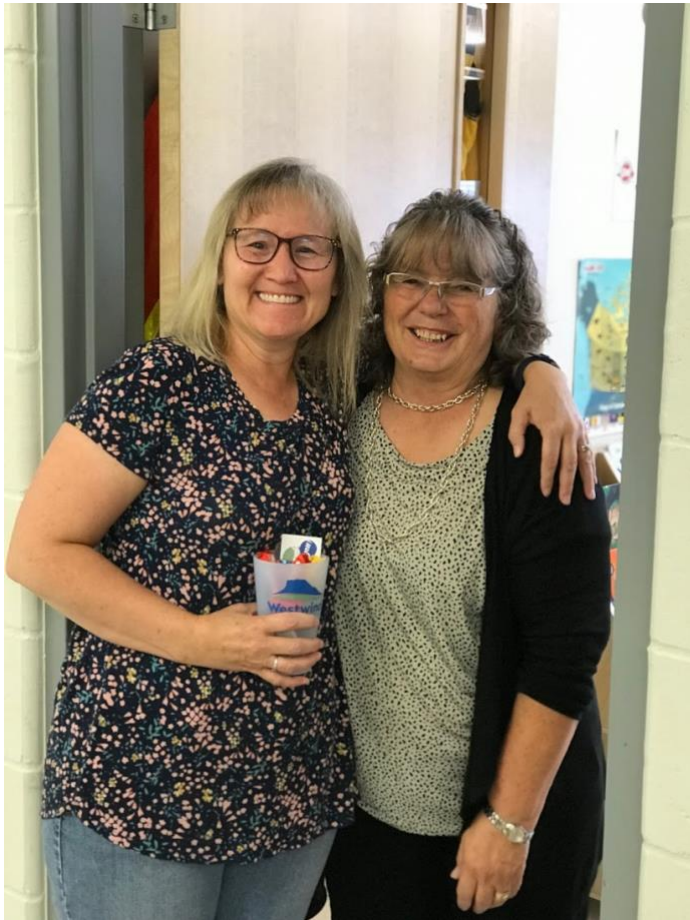
Trustee delivering treats on World Teacher Day.