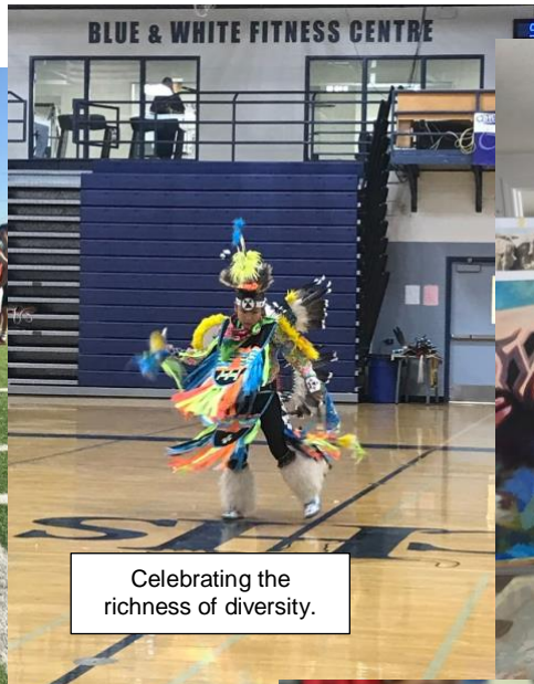
Celebrating the richness of diversity.