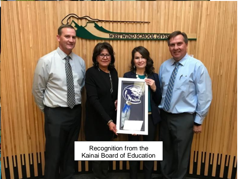
Recognition from the Kainai Board of Education

Education includes more than what goes on in the classroom!